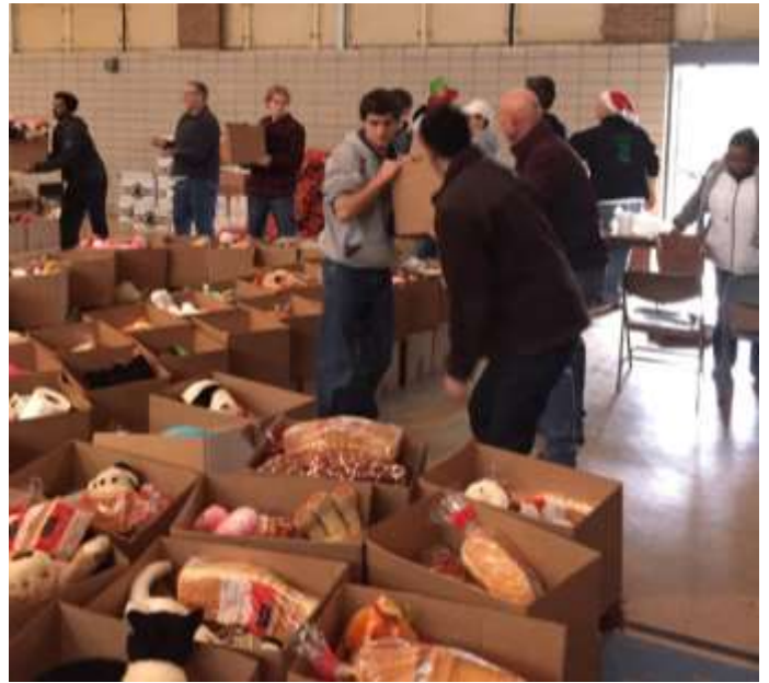
Volunteers sorting the Food to be placed in Baskets