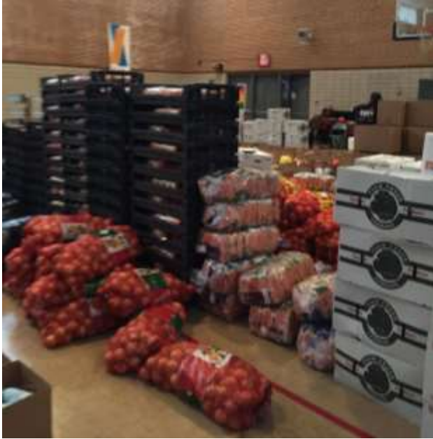
Donated Food Arrives